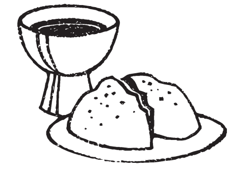
Receiving Holy Communion