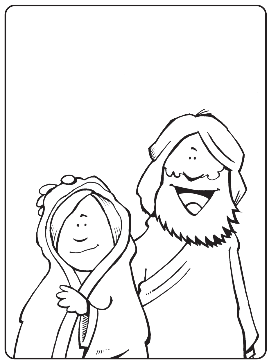
"Go in peace! You are healed."